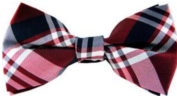
Checkedred Bow Tie €15 My Kind of Tie

We have slowly but surely begun to embrace our inner Dapper Dan's in recent years, with more emphasis than ever being placed on ties, lapel pins, and other aesthetic accoutrements. However, it can often be a tad difficult to find original styles on the high street that offer that perfect balance of quality, style and value. With this in mind, mykindoftie.com has appeared on the market as a brand new Irish business that offers high quality products at a reasonable price. With ties and bow ties for just €15, and a whole host of prints and patterns to choose from, the site really is the perfect place to indulge in some flashy fashion – without breaking the proverbial bank. This navy and red checkered bow tie is a personal favourite, with its colour palette lending itself to a plethora of suits and dapper details. Suit up, gentlemen!